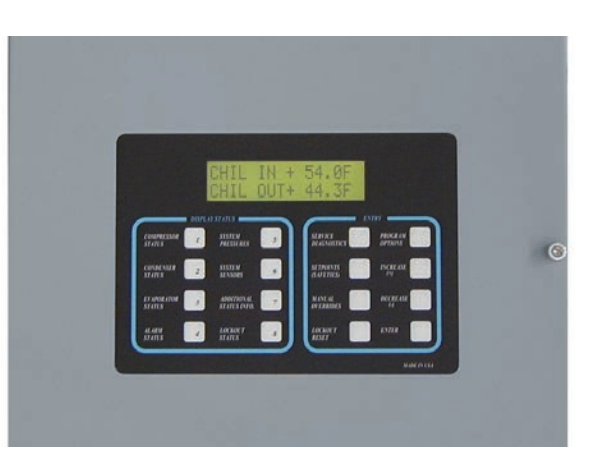
New MCS-8 Keypad mounted on door enclosure